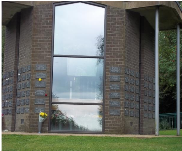
Chapel of remembrance

Work is currently underway regarding making applications for water consents in the first instance, we do however have initial drawing for location of installation if we were to progress.