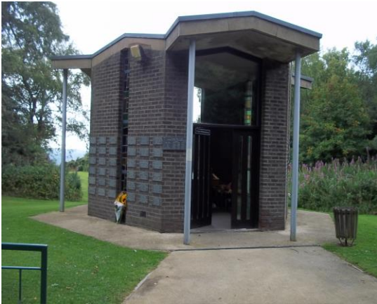
Chapel of Remembrance